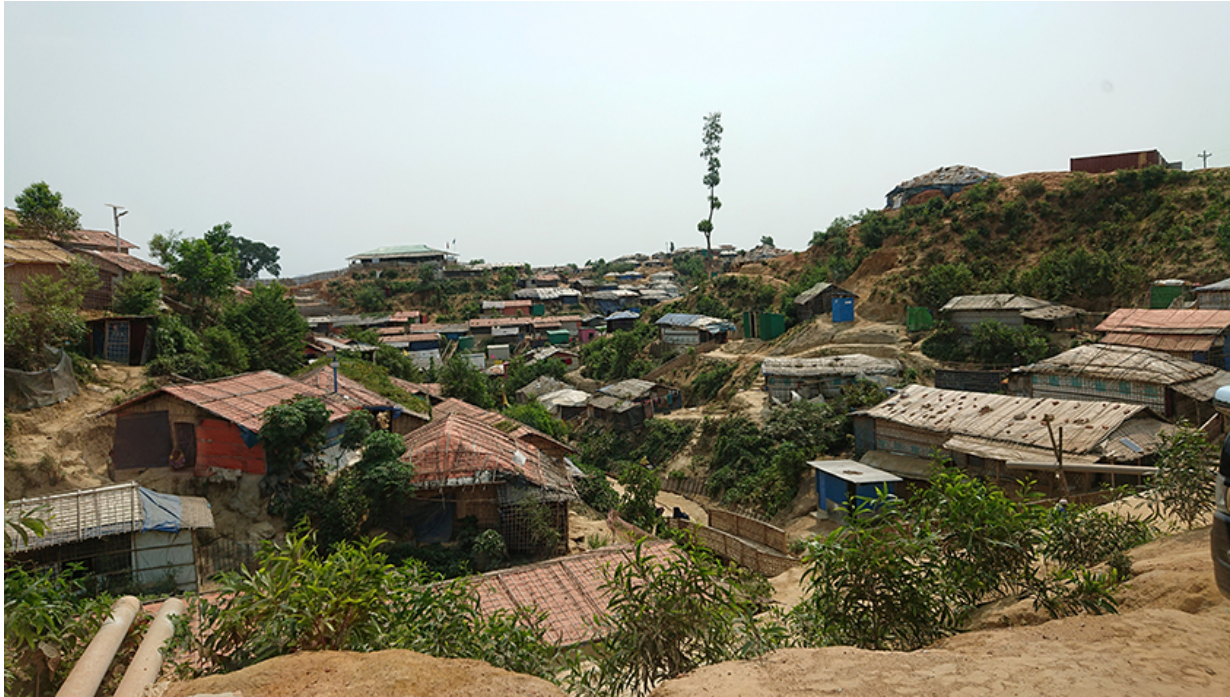
Rohingya camp, Cox's Bazar, Bangladesh.