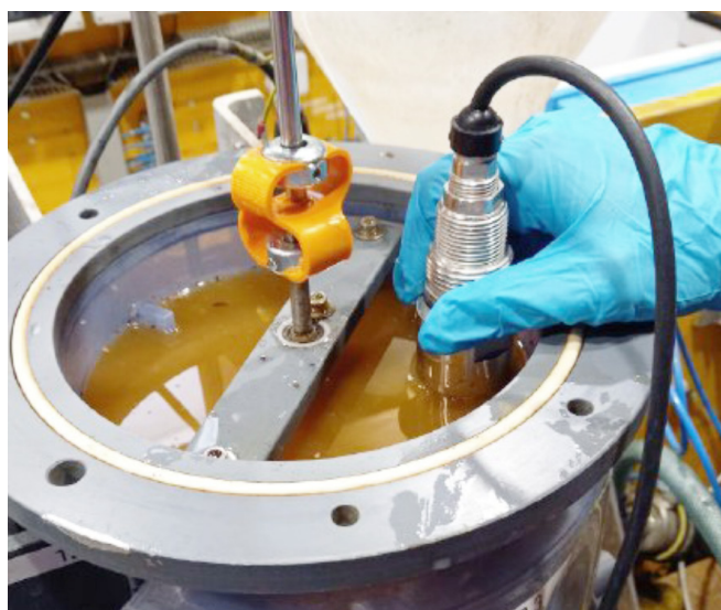
Michael Vogel, Eawag

Automated dosing of conditioners: The under- or over-dosing of conditioners greatly impedes dewatering performance. Eawag is currently developing solutions for automated dosing of conditioners based on inline monitoring of physical and chemical properties, building on our previous research. This also includes identifying methods for the selection of optimal conditioners.