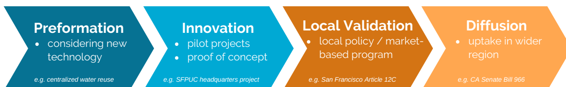
Figure 2. Phases within a transition pathway for innovative technology.

The case of San Francisco sheds light on how other cities might be able to navigate institutional complexity as they look to adopt onsite water reuse. Three major takeaways include: