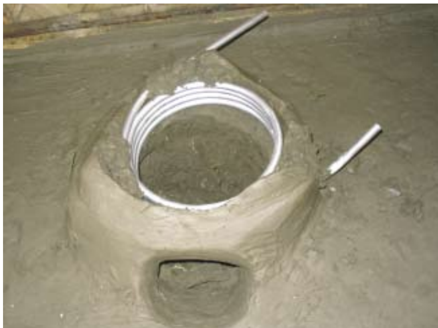
Fig.1a. Chulli system being constructed