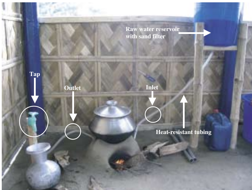
Fig. 1b. Chulli system components