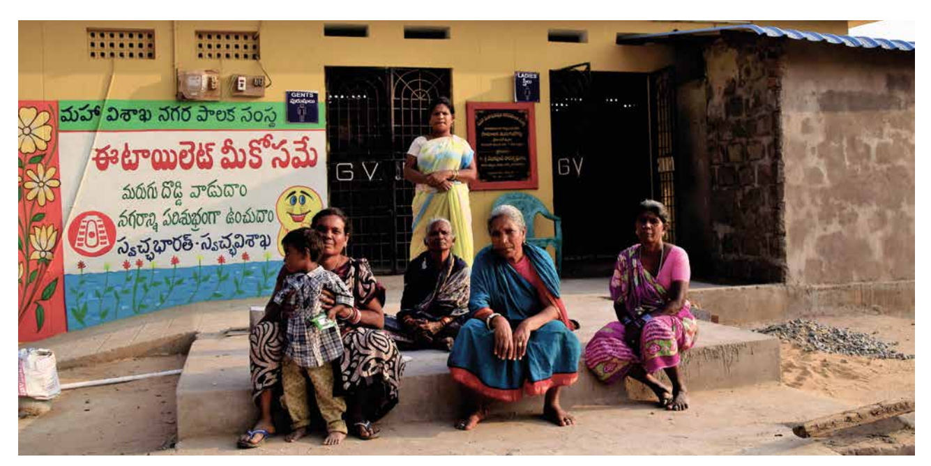
Public toilet in Visakhapatnam, India.

The city government used conclusions from this evaluation to design and set up sanitation facilities for women in Warangal, including four women-only toilets.