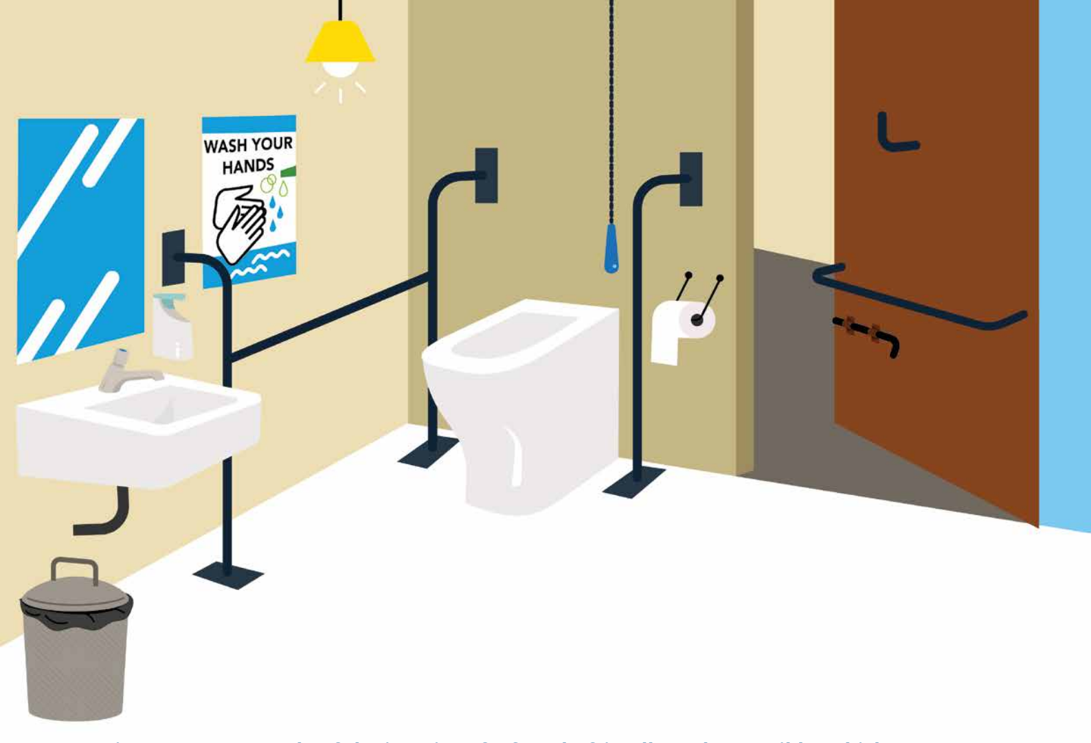
Figure 4: An example of the interior of a female-friendly and accessible cubicle.