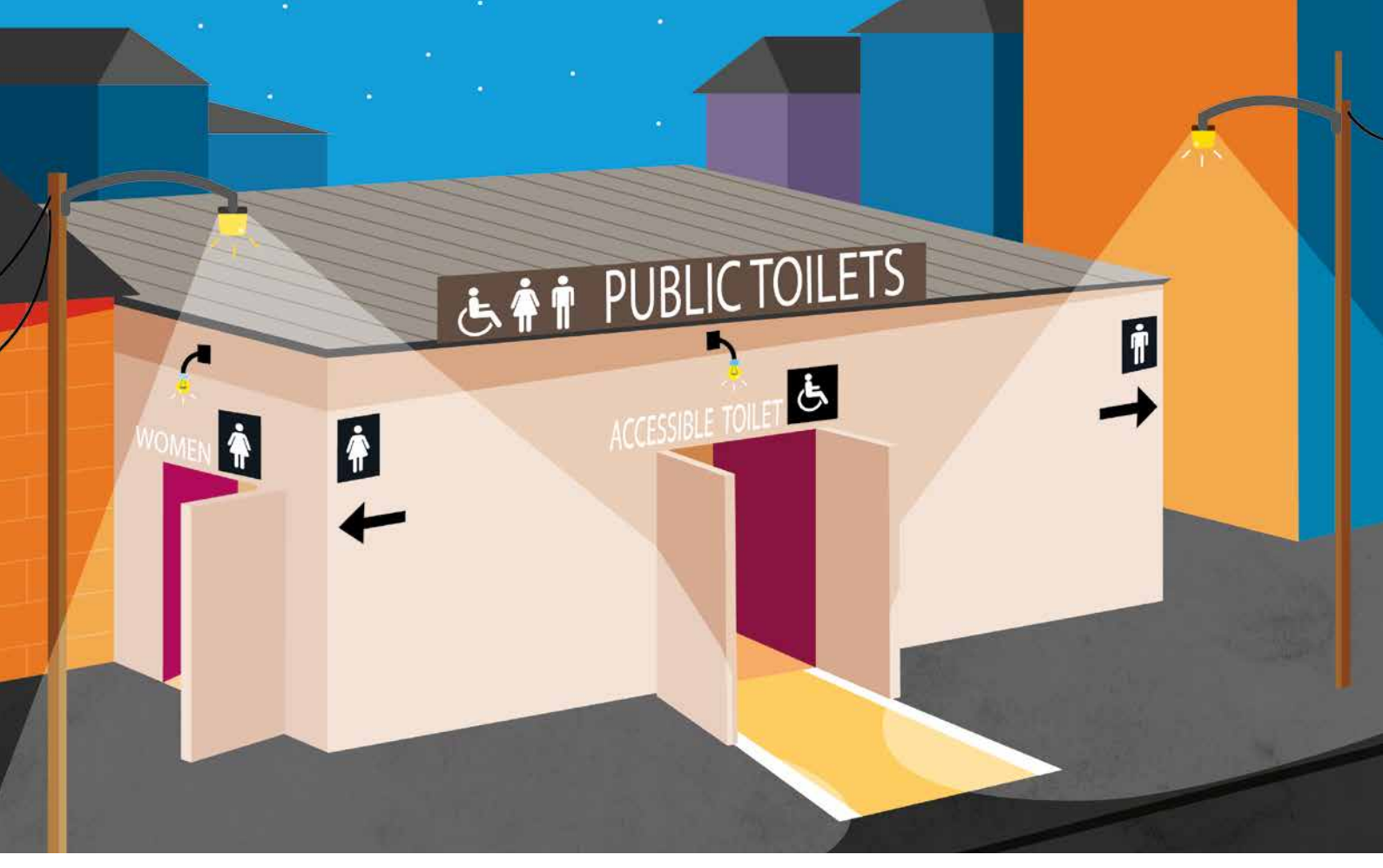
Figure 1: An example of the exterior of a female-friendly toilet block.