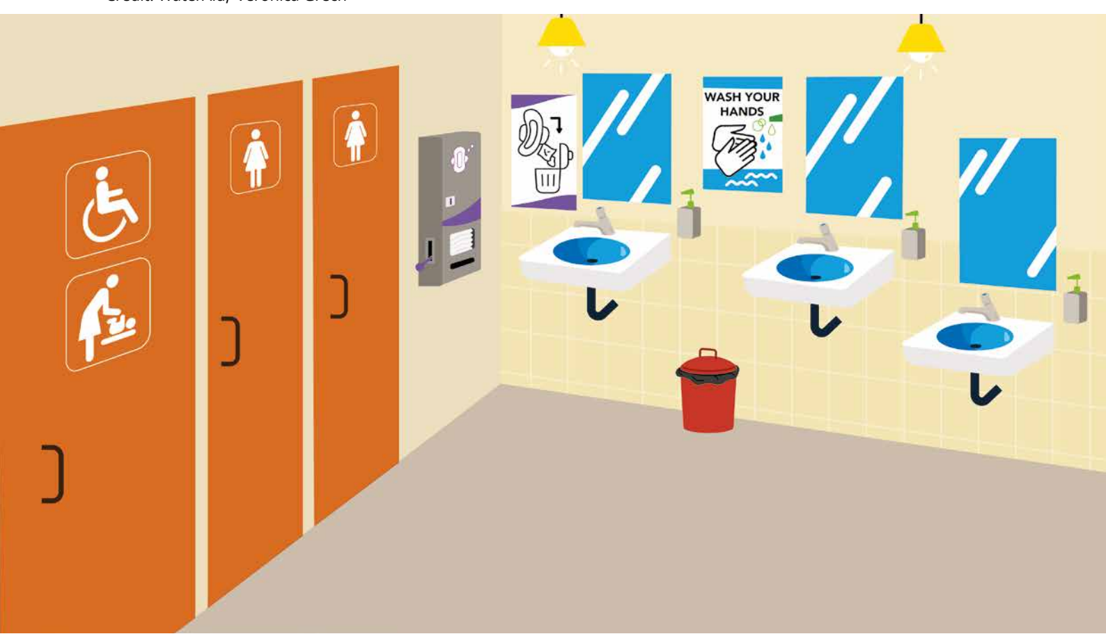
Figure 2: An example of the interior of a female-friendly toilet block.