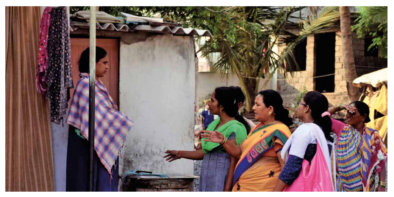
Community engagement under the Swachh Bharat Mission, Visakhapatnam, India.

The mapping exercise indicated that more than 20,000 people relied on the city's public and community toilet blocks. Of the 262 such blocks in operation, the study found only six to be in 'good' condition. Upgrading these facilities was identified as a crucial component of city-wide activities to eliminate open defecation. In response to the mapping exercise and gender-needs assessment, particular attention was given to the needs of women and girls in upgrading 198 of the toilet blocks – approximately 4,000 toilet seats – where WSUP and the Greater Visakhapatnam Municipal Corporation implemented gender-sensitive retrofitting plans.