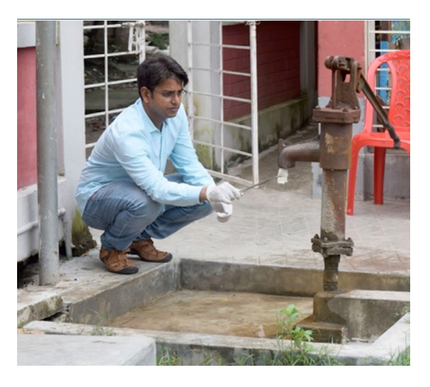
Figure 4: Water quality testing by the SafePani project