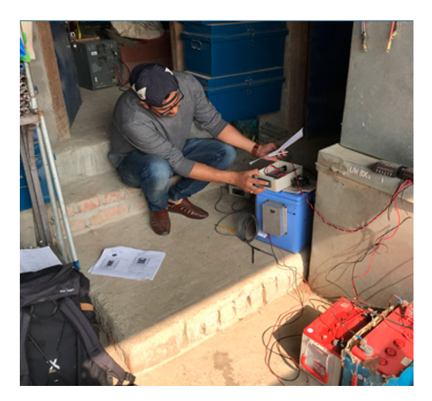
Figure 3 : Locally constructed solar-powered incubators in Nepal

The laboratories make use of simplified equipment options, such as locally constructed, solar-powered incubators (Figure 3) and locally available microbial testing materials.