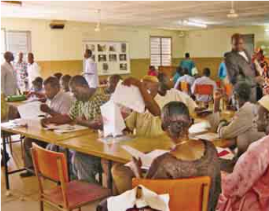
Stakeholders divided into two groups discussing the scenarios during the final workshop on strategic FSM planning in Ouahigouya, Burkina Faso.

these results, we chose the involvement approach consisting of focus group discussions and all-stakeholders workshops. During the final workshop, the entire involvement process was evaluated by the stakeholder themselves through a questionnaire.