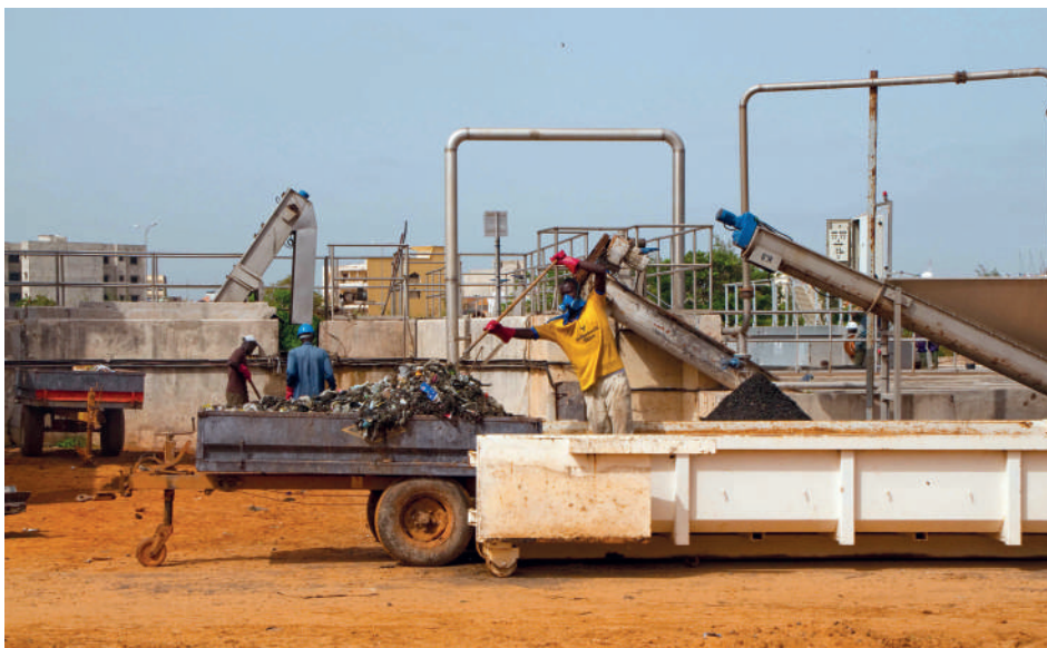
Figure 11.1 Maintenance worker cleans mechanical screens, a critical activity to be performed each shift to keep the system operational, Dakar, Senegal.

Many FSTPs fail following construction, regardless of the choice of technology or the quality and robustness of the infrastructure. Reasons for failure are not always investigated, but the most frequent explanations given are low operational capacity (Fernandes et al. , 2005; Lennartsson et al. , 2009; Koné, 2010; HPCIDBC, 2011), and the lack of financial means to accomplish O&M tasks (Koné, 2002). Lessons learned from these failures are that O&M must be considered as an integral component of the full life cycle costs of a facility, and that ongoing training and capacity building is essential for the operators. In addition, the O&M plan must be incorporated into the design process and receive appropriate review and approvals along with the engineering plans. This helps to ensure that O&M is fully integrated into the facility once construction is complete and operation has begun.