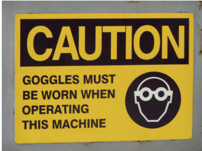
Figure 11.6 Safety posters and signs are good reminders to follow proper procedures.

The “Health and Safety Plan” specifies the procedures, practices and equipment that should be used by employees in order to conduct activities in a safe manner. Health and safety plans are prepared specific to each FSTP but also contain aspects that are common to all FSTPs. Health and safety procedures are strictly enforced by management through the preparation of the safety plan, and also through posters and signs located in areas of risks (e.g. ponds and tanks, electrical device, confined spaces). An example of a safety notice is provided in Figure 11.6. Based on the authors’ experience, the following topics should be included in the health and safety plans: