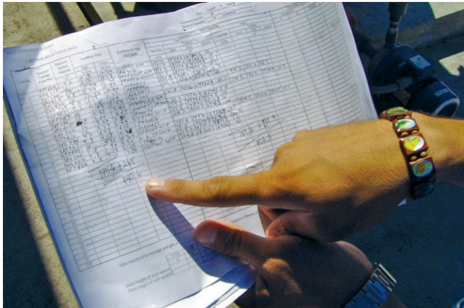
Figure 11.5 Reception reports track the total number of loads delivered, the time, date and driver's name. These records are important to maintain for all faecal sludge treatment plants (photo: David Robbins).