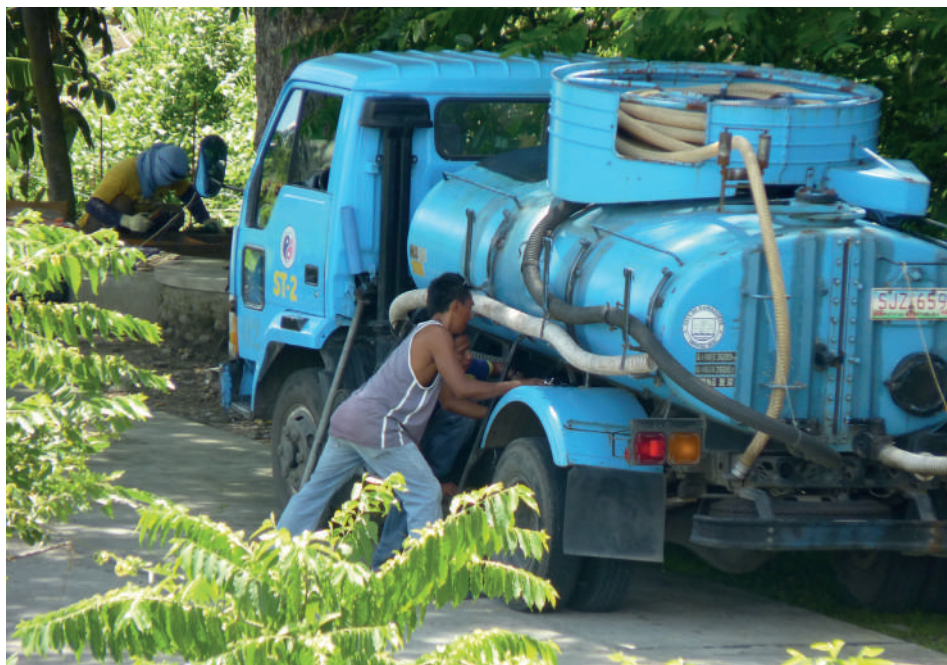
Figure 11.2 Maintaining the fleet of faecal sludge vacuum trucks in Dumaguete City, Philippines, (photo: David M. Robbins).

The distribution of the FS volume received at the plant throughout the day is critically important in the planning process, as low or high flows that exceed the design of the treatment system can have a significant impact on the operational efficiency. The initial planning phase must therefore ensure that the chosen technology is appropriate for local conditions, and that it is correctly sized to accommodate the expected volumes and related fluctuations. Institutional arrangements that closely coordinate activities between facility owners and those responsible for the FS collection and transportation can help to address these issues.