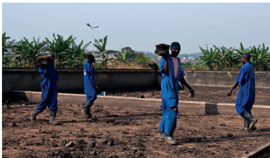
Figure 11.7 Sludge removal from drying beds at the Bugolobi Treatment Plant in Kampala, Uganda.