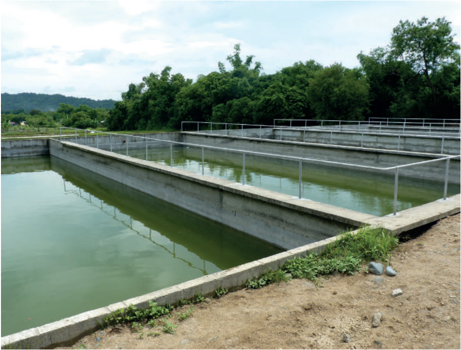
Figure 11.8 Starting up period of faecal sludge lagoon system, San Fernando City, Philippines. In this case, lagoon basins were seeded with activated sludge from a nearby wastewater treatment plant.

The operating hours of the FSTP and the procedures for FS discharge (e.g., FS characteristics and discharge fees) should be monitored over several months and discussed with the collection and transport stakeholders. Similarly, the treatment efficiency of the plant, and the quantity and quality of endproducts needs to be assessed, and the enduse or disposal procedures defined and agreed upon with the relevant stakeholders.