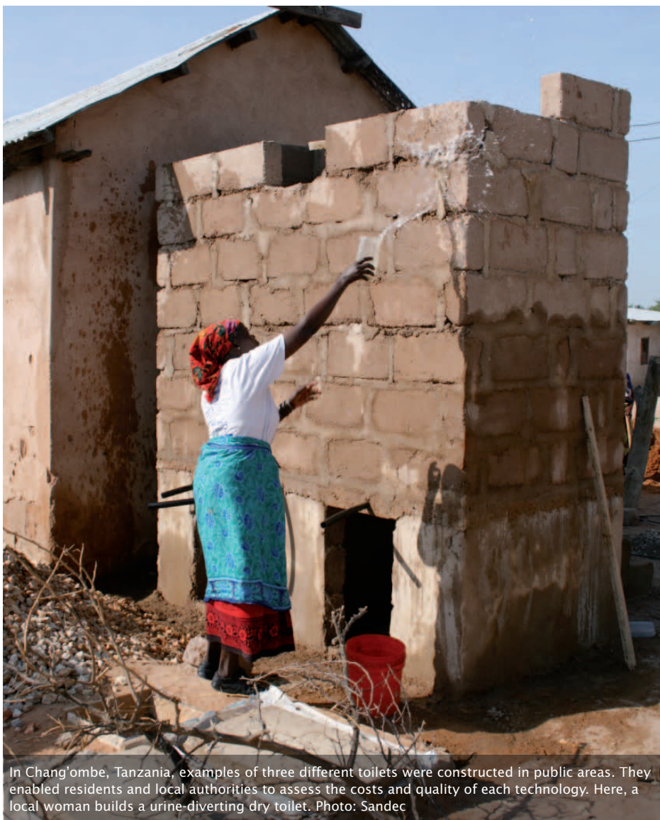
In Chang'ombe, Tanzania, examples of three different toilets were constructed in public areas. They enabled residents and local authorities to assess the costs and quality of each technology. Here, a local woman builds a urine-diverting dry toilet.