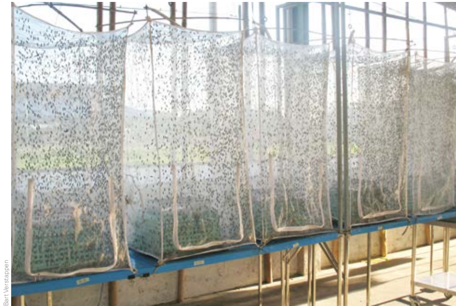
Photo 2: Adult Black Soldier Flies reproduce in “love cages” and the eggs develop into young larvae.

Compost production is relatively simple and can convert most OW fractions. Also, Javanese agricultural soils are low in organic matter due to the ongoing and decennia-long intense agricultural practices and the promotion and subsidising of chemical fertilizers. Thus, compost could play an important role to sustain soil fertility and structure. Yet, without governmental promotion and financing or preferential treatment in the marketplace, compost can barely compete with fertilisers and other soil amendments.