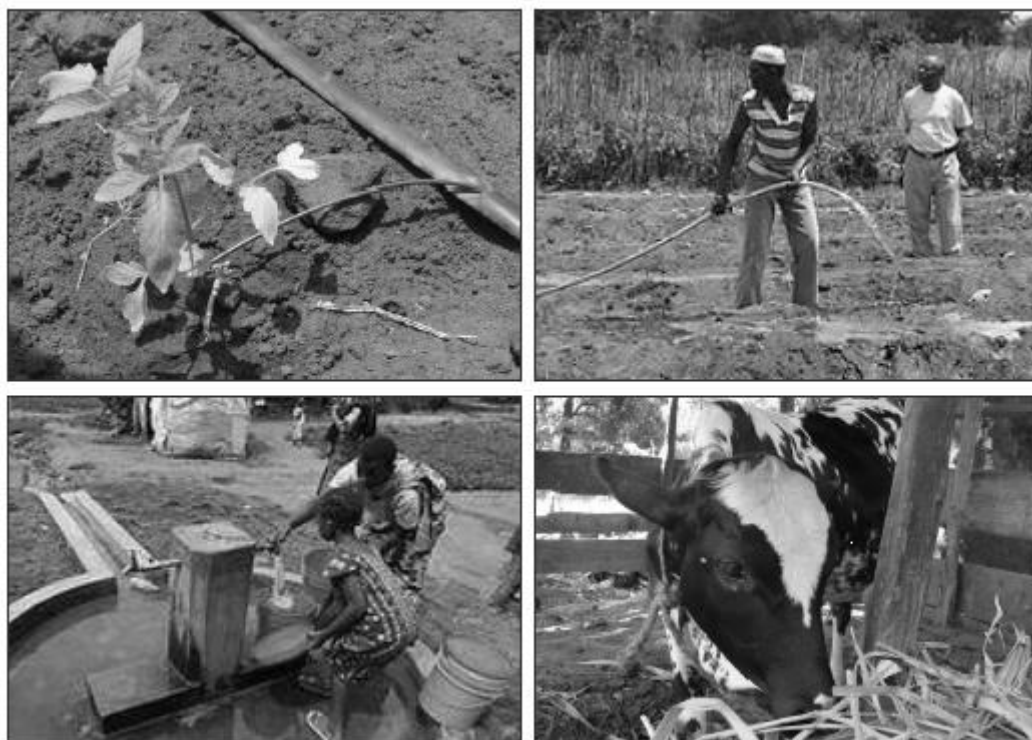
Figure 1. Impact boosting activities within the WA-WASH and iWASH programs

Background: The first program, called the West Africa Water, Sanitation and Hygiene (WA-WASH) program in Burkina Faso (2011 to 2015), offered households the option to invest in subsidized self-supply (upgraded private wells equipped with rope pumps), along with other program activities. The second program, called the Integrated Water, Sanitation and Hygiene (iWASH) in Tanzania (2010 – 2015), used a demand-led approach to engage community members during the installation of new or upgraded communal water supply systems (reticulated networks, upgraded community wells with rope pumps, and/or livestock troughs). Both programs featured “impact boosting activities” that were tailored to local conditions and designed to maximize the systems’ potential for productive use. These activities included seed distribution networks, market garden demonstrations, support for improved poultry housing (kinengunengu) and livestock husbandry (Figure 1).