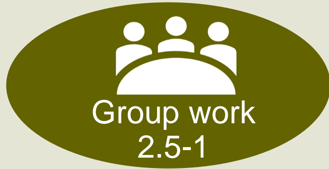
Table-group activity: Behaviour change