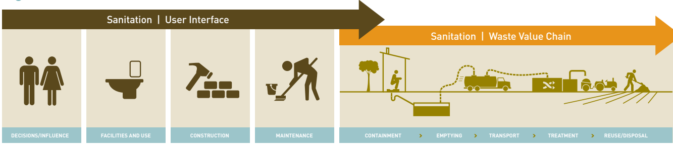
Figure 1: Sanitation value chain

This section explores gender differences across the sanitation value chain (Figure 1), from the user journey through the fecal sludge value chain. The analysis is intentionally focused on first uncovering where gender differences exist and then assessing whether and how these differences influence sanitation access. There are notable gaps in the evidence, especially across the backend of the value chain, that require further investment and research, but sufficient evidence exists to suggest that gender matters at each point of the value chain.