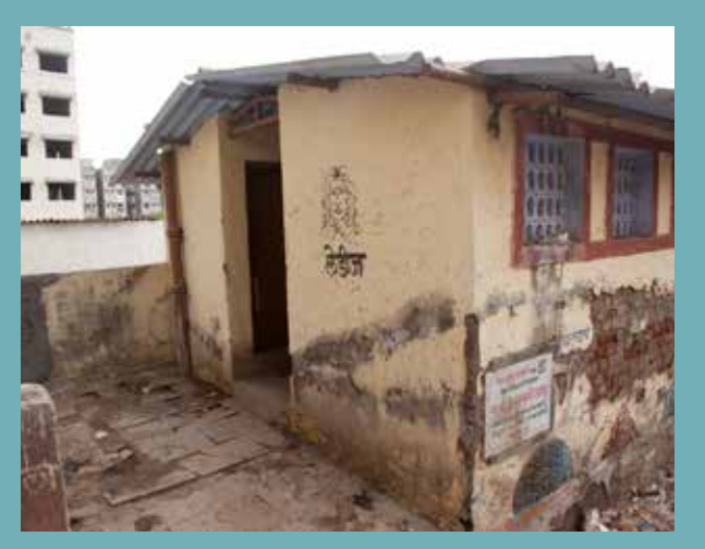
A run-down municipal toilet in a slum in the Vash Naka locality of Mumbai, India.

Failure to consider gender differences in product and service design can add to women's workloads and affect their education and income. Poor sanitation directly correlates with women's time lost addressing health concerns (contacting pathogens and becoming sick or seeking healthcare), cleaning water (collecting clean water or boiling dirty water), and accessing the toilet (finding a suitable place to defecate, either in the open or at public facilities), which takes away from time they can spend going to school or work. For example,