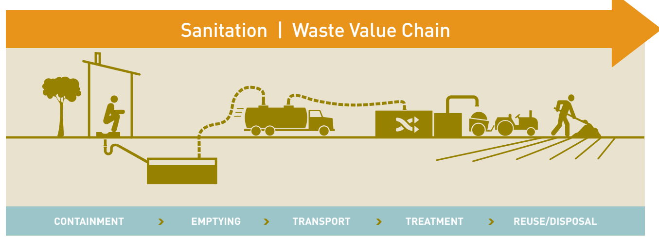
Figure 3: Fecal Sludge Value Chain

design. Emerging evidence underscores the importance of actively engaging diverse perspectives and experiences to ensure products, services, and systems are designed to address users' gender differences.