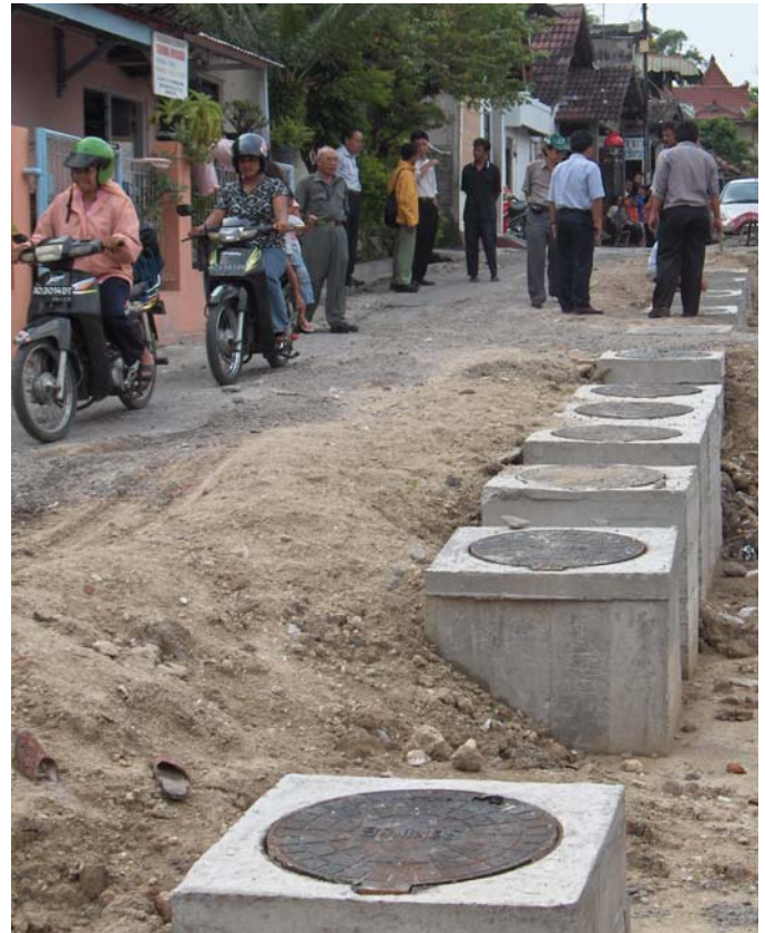
Drainage system construction in Blitar, East Java

The formal adoption of the PPSP roadmap by the SanTT and its member ministries, and its public launch in December 2009 by the Vice President of Indonesia, with the Governor of Jakarta and all the relevant ministers present,