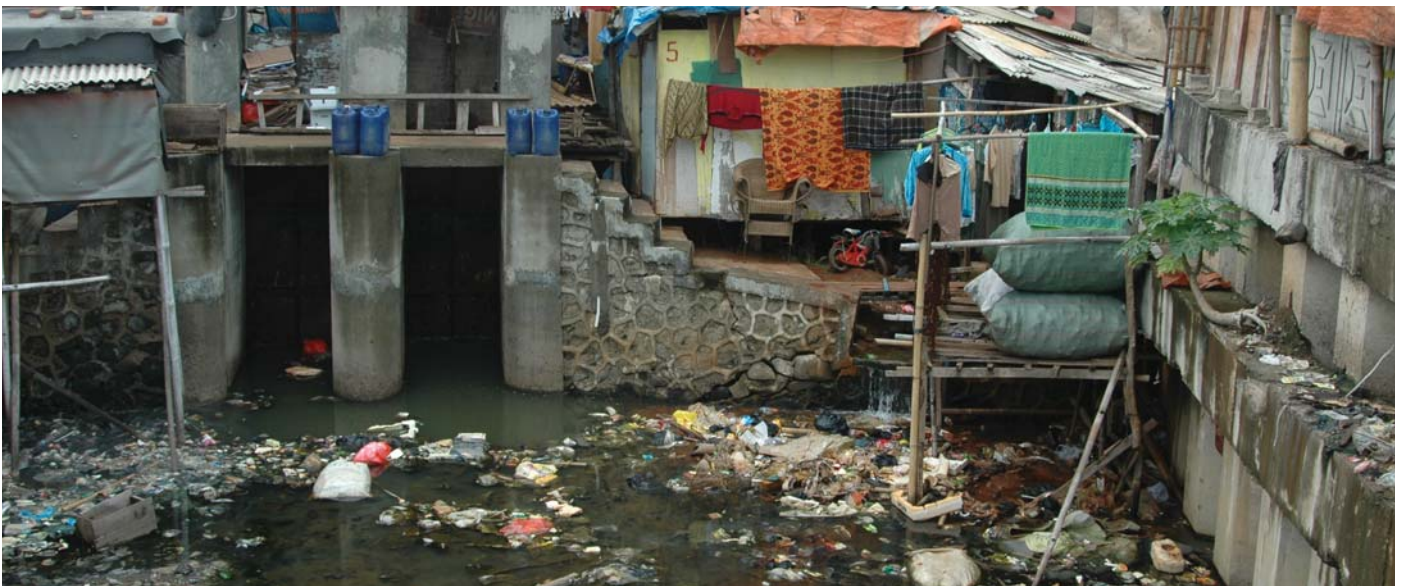
Environmental sanitation challenges from inadequate wastewater, refuse, and drainage disposal

In 2001, the government embarked on a rapid and far-reaching decentralization process. This formalized local government responsibility for the delivery of urban sanitation services (among other things) but did not lead to any significant improvements on the ground. A critical constraint was that responsibility was devolved without clarifying what exactly municipalities should do, how they