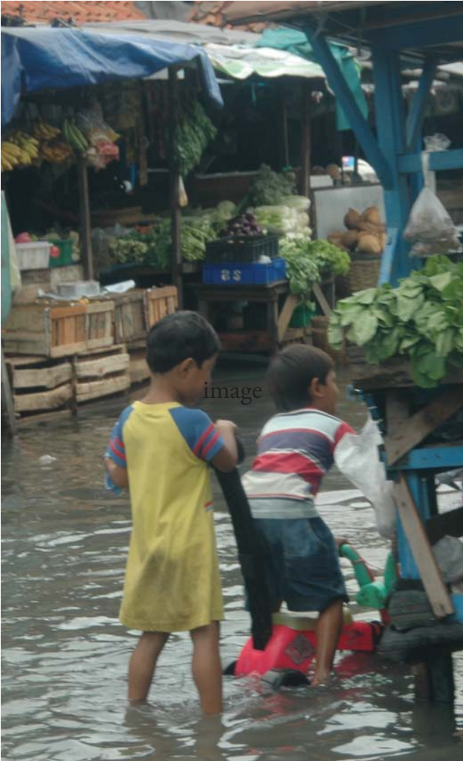
Children playing in an inundated market in North Jakarta, in which flooding is part of daily life

Earlier in this decade, the Government of Indonesia had begun to acknowledge that the country faced an urban sanitation crisis, but the lack of attention to sanitation in the past meant that it was inexperienced in this field and that the policy and institutional framework for the sub-sector was underdeveloped. The Indonesia Sanitation Sector Development Program (ISSDP) was designed to resolve these constraints. In essence, it provided technical assistance to strengthen the policy and institutional environment in order to increase investment in urban sanitation at national and local levels; expand service coverage; and improve service quality and sustainability. It was envisaged that all of these would accelerate progress towards the sanitation