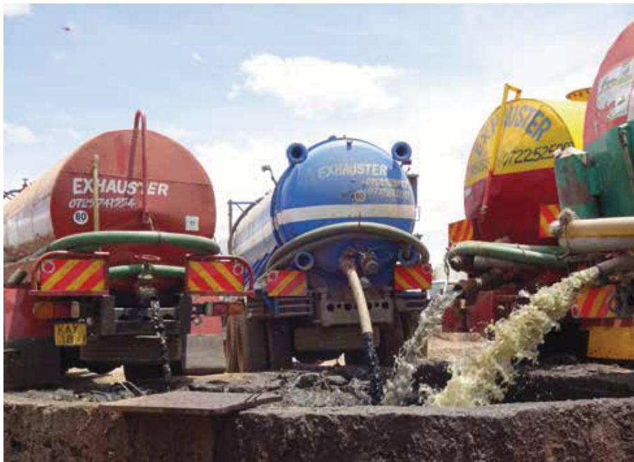
Trucks empty fecal sludge into sludge-drying beds in Nairobi, Kenya.

Further Reading: https://tinyurl.com/y89fbxr4