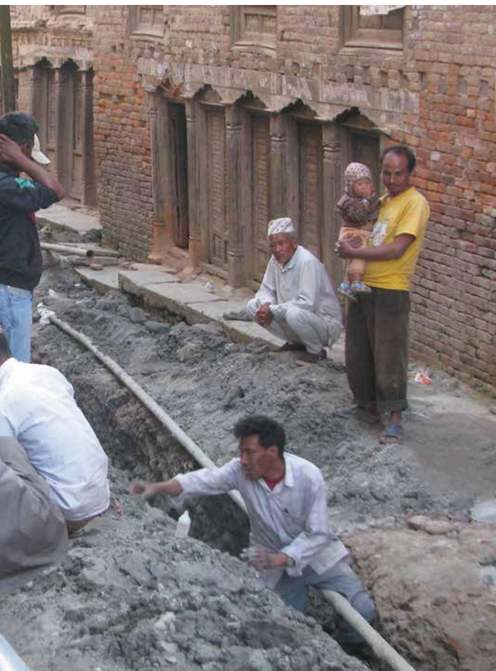
Simplified sewers are being installed in Nala, Nepal. Photo credit: CIUD

Source: Manila Principles on CWIS. Source: (Narayan and Lüthi 2019)