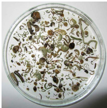
Conventional methods used to inventory macroinvertebrates are extremely time-consuming.

Photos/graphics available for download from www.eawag.ch >> Media; they may be used free of charge only in connection with reporting on this media release and are not to be archived. Source to be cited: Eawag