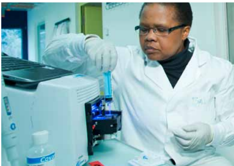
Fig. 4: In the Molecular Genetics Laboratory at Eawag's Kastanienbaum site, a technician carries out genome sequencing on fish samples. Modern analytical methods facilitate the study of biodiversity in lakes.

To investigate the migration of fish between Lake Lucerne and its tributaries, a research team led by fish biologist Jakob Brodersen implanted microchips in more than 5000 brown trout. The signals received from these so-called PIT tags indicate when the young fish migrate from the streams into the lake, and when the adults return to the spawning grounds. The initial results show that the proportion of migratory individuals in the various populations ranges from 5 to over 50 per cent. The timing of migration can also vary by more than two months. "This differs from one canton to another," Brodersen quipped. "For example, denizens of canton Uri are tardier than in Canton Nidwalden." The returning fish also differ markedly in size, measuring between 25 and 70 centimetres in length. According to Brodersen, measures to conserve and sustainably manage this species – which is endangered in Switzerland – would need to take these differences into account, e.g. when minimum catch sizes are specified for fisheries.