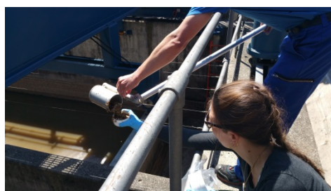
Sampling at the Werdhölzli treatment plant in Zurich.