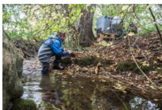
Collection of samples on the Hoobach (Schaffhausen), left, and the Eschelisbach (Thurgau), right.